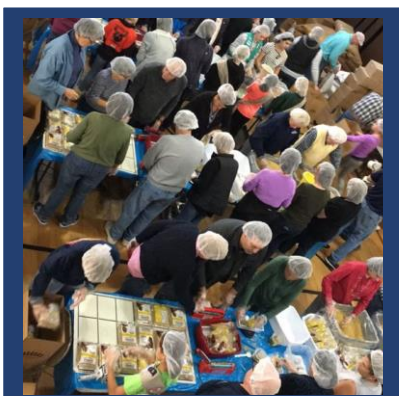
Babylon Ends Hunger 2015

The Babylon Village Classic IOK Dirty Sock Run, which is part of the USATF Long Island Track and Field Cross Country Series, is more than just a race. Besides giving runners a chance to compete and have fun, the Run raises desperately needed funds for our twelve local food pantries and soup kitchens through the generosity of sponsors like you. Over the past fourteen years, the Babylon Rotary Club has supplied over $260,000 in food and pantry donations to the Babylon food pantries and soup kitchens. The Dirty Sock Run is an essential part of the Rotary's efforts to eradicate hunger in our community.